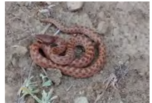
Desert Night Snake