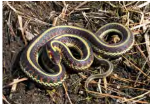
Common Garter Snake