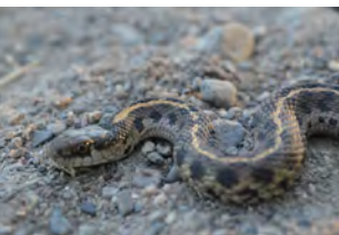
Terrestrial Garter Snake